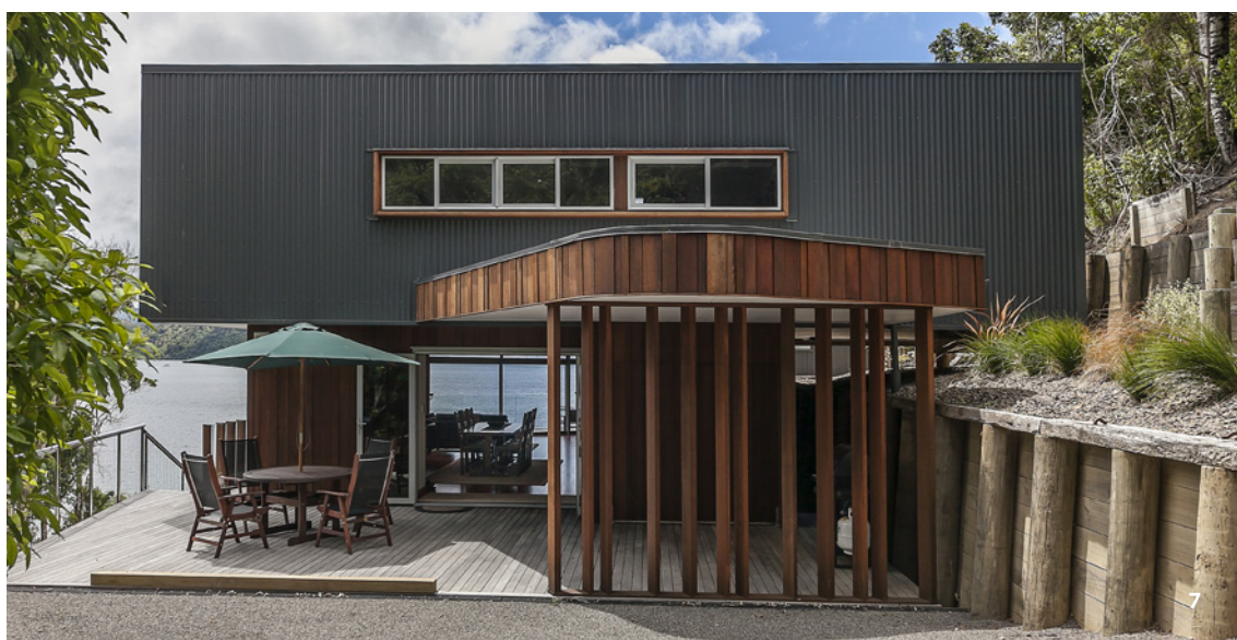
1 The soothing waters of the Sounds are just a stone's throw from the deck of this Marlborough holiday home 2 The house is set back from the beach giving shelter from the elements 3 The house has stunning views up the Sounds 4 The house stays within the footprint of the original A-frame bach 5 Cedar chiplap cladding offers protection from the elements 6 The timber and colour steel exterior works well in a marine environment 7 The rear deck offers a sheltered dining area