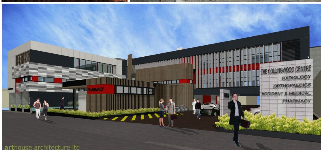
Above: architect Jorgen Andersen surveys the exterior during construction; terracotta tiling echoes the pattern of DNA; Nelson Radiology's $700,000 CT scanner being hoisted onto the first floor; architect's impression of the finished building