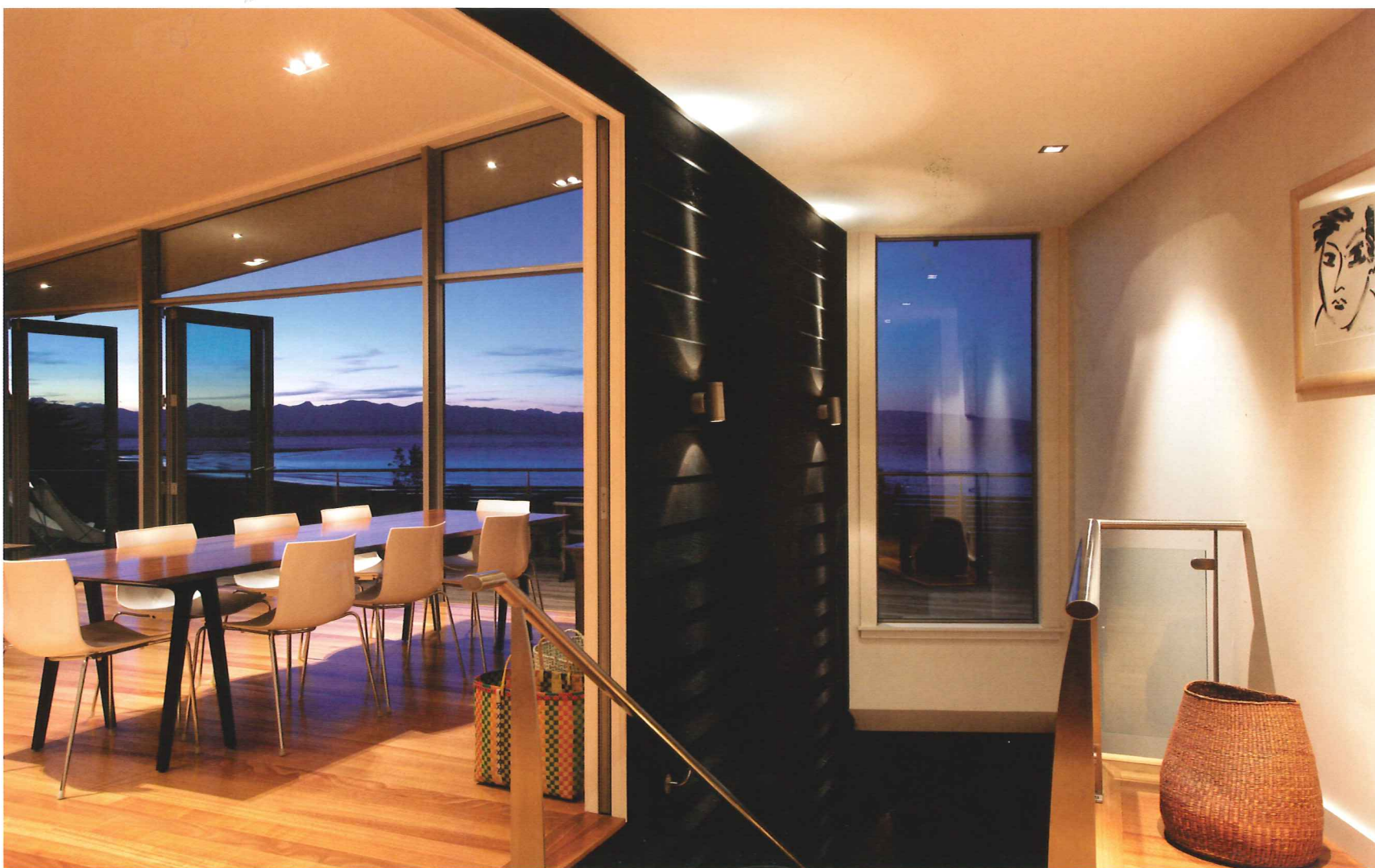
Wallace Marshall House