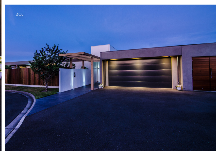
16. Clever landscaping and the rise of 1.5 metres from one end of the section to the other is barely noticeable 17. With the home's four outdoor terraces and moving screens, there's always somewhere to shelter from the wind 18. The call for 'Master' awaits at the main entranceway 19. Entranceway and garage/workshop 20. Appealing street frontage

Designed by Jorgen Anderson, Arthouse Architecture