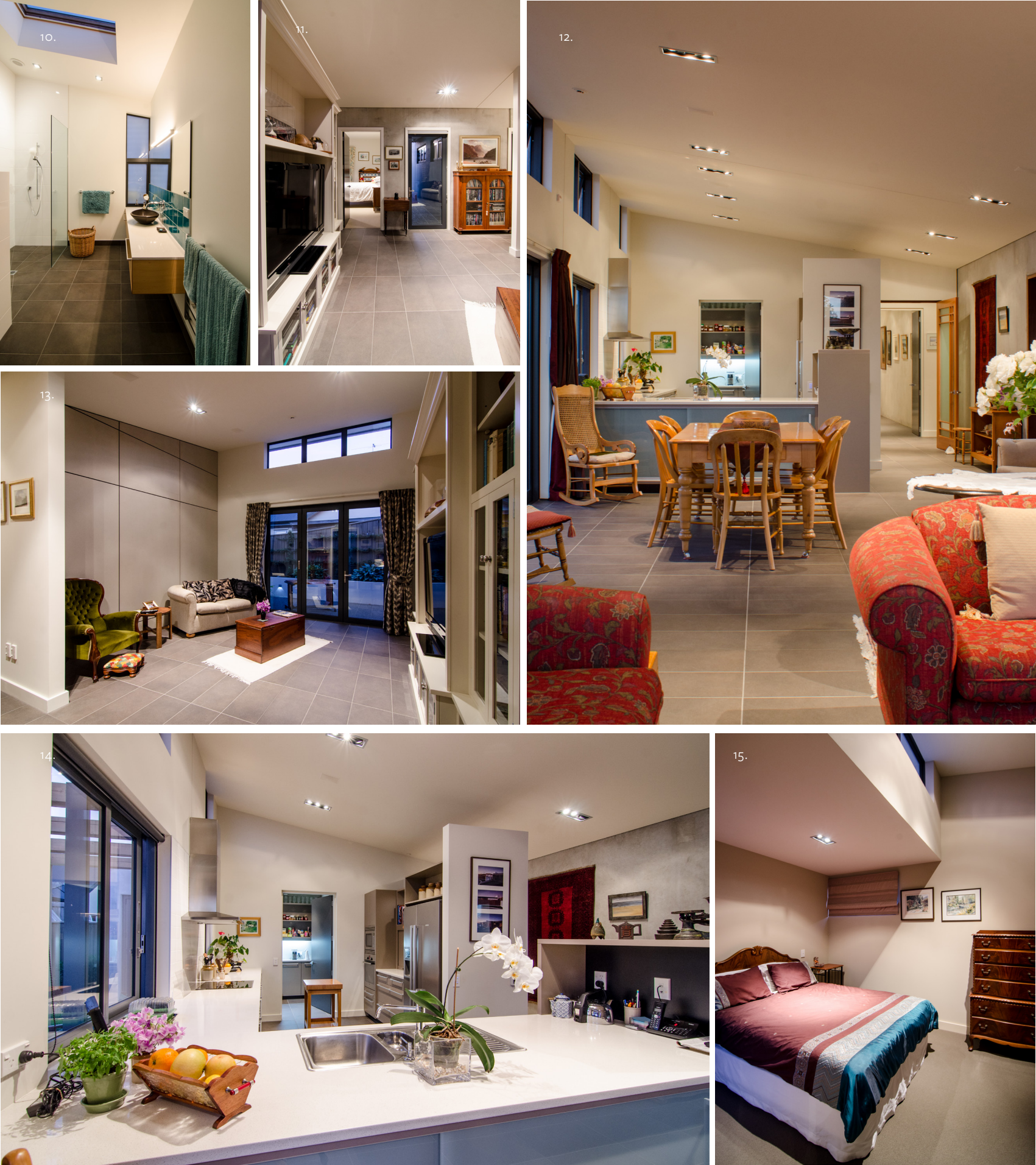
10. Main bathroom 11. Mike may 'encourage' the rugby ref as much as he likes in the TV room 12. Main living area 13. The TV room also works well as a second lounge for visiting kids 14. Cheryl's beloved pantry is positioned at the end of the kitchen 15. Cheryl's mother's old bedroom suite fits in nicely to this contemporary interior