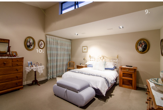
1. The home needed to be totally flat and accessible 2. The open plan living area offers light, warmth, space and versatility 3. Inordinate care was taken in laying the non-slip floor tiles throughout the house 4. En suite bathroom 5. Cheryl and Mike Carnahan 6. Period and new pieces blend happily in this modern home 7. The office is the hub for the couple’s history and genealogy related projects 8. Meeting accessibility needs required nothing more than good design 9. Current and historical family photographs adorn the walls of the spacious main bedroom